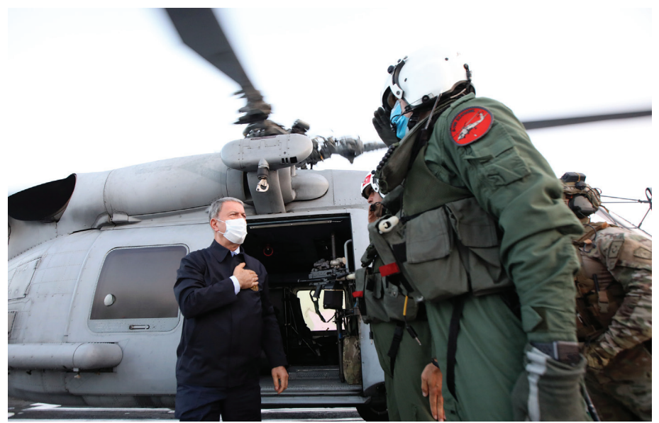
Turkish Defense Minister Hulusi Akar and Chief of General Staff General Yaşar Güler visit Turkish Naval Task Group's ship in the Central Mediterranean, flying in from Mitiga Airport in Tripoli, Libya on July 4, 2020.