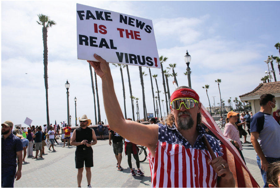
A protester holds a poster reading "Fake News Is The Real Virus" during a demonstration in the U.S. Huntington Beach, California, on May 9, 2020.