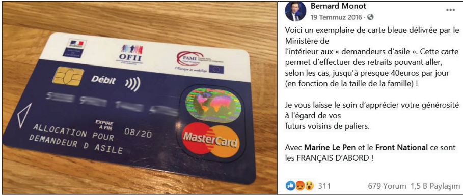
Image 2: Fake News in France Supporting Right-Wing Election Position.

Image 2 provides an example of the institutionalization of anti-immigration policies. Bernard Monot claims, “The state has created a card that gives refugees 40 euros a day.” At the end of this lie, it states, “With Marine Le Pen and National Front, French people will be prioritized.”