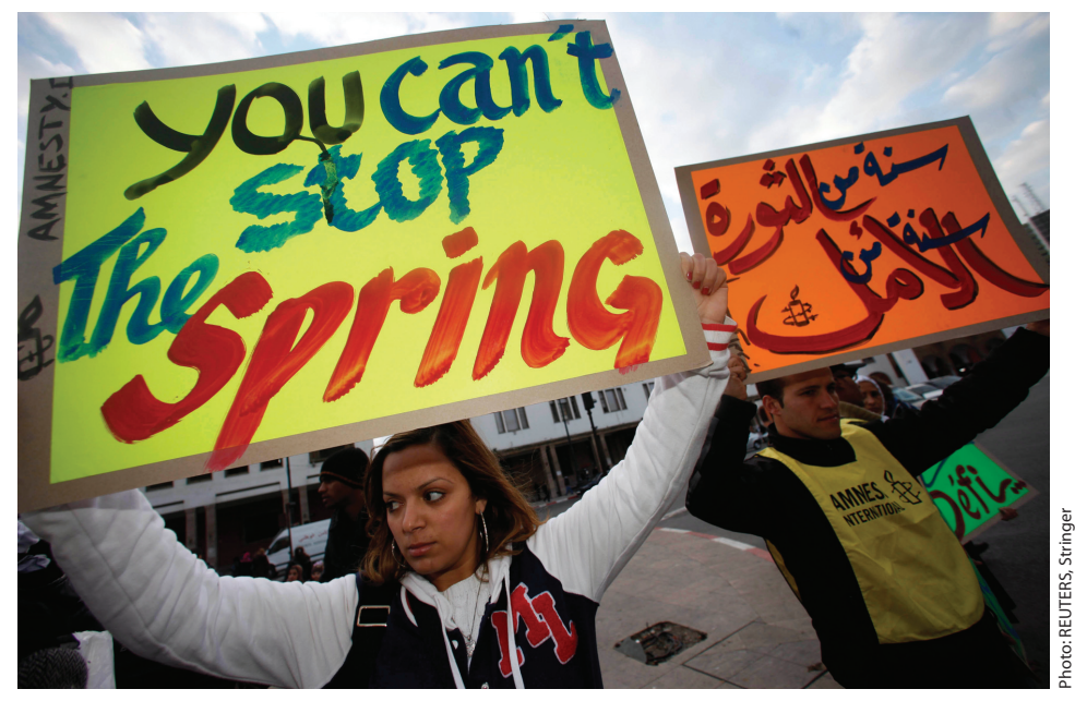
Moroccans hold signs during a peaceful march to show solidarity with Tunisians and mark the first anniversary of the Arab Spring revolution in Rabat.

for Syrian armed rebel groups. To be sure, Turkey's major aim is to depose