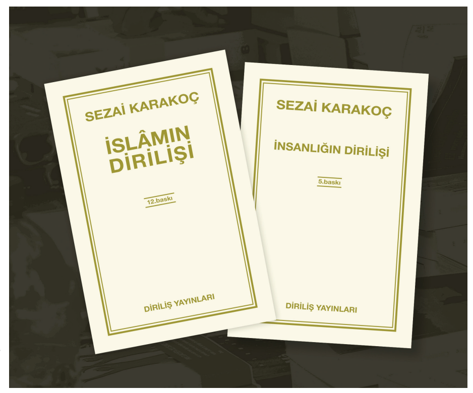
Two well-known books by Sezai Karakoç: "The Revival of Islam" and "The Revival of Humanity".

In conclusion, this article includes Karakoç and Erbakan in the camp of Cold War Pan-Islamism, utilizes the analysis of their writings to demonstrate the distinctiveness of Turkish Islamism and Pan-Islamism in relation to others, and identifies the effects of nationalism on the communication of the Pan-Islamist message in Turkey.