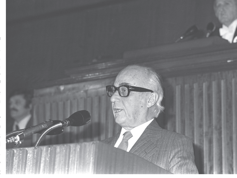
Then Minister of Foreign Affairs, Hayrettin Erkmen, was expelled from his post after the motion of non-confidence given by Necmettin Erbakan's National Party (Milli Selamet Partisi) in 1980 because of his pro-Western and pro-Israeli policy.

Karakoç and Erbakan about a civilizational contraposition between Islam and the Western world represent a connection with the early 19th century Pan-Islamism. The fundamental reference to civilization that their world order visions have in common binds them to each other. More than others, they stand as bridges from early Pan-Islamist tradition to today's civilizational discourse in the AK Party's foreign policy. 118 Erbakan, as the founder of the political movement from which the AK Party eventually evolved, uses this Huntingtonian idea in his discourse as party leader. Karakoç, given the abovementioned influence acknowledged by AK Party officials, emerges as the Islamist intellectual who reasoned the most on this civilizational divide and its foreign policy consequences both in his writings published in Islamist reviews and within his collections of articles. An analysis of Karakoç and Erbakan's texts on foreign policy or world order shows the emergence of a Turkish neo-Pan-Islamism circulating in and out of political organizations. More specifically, the similitudes between their thoughts also suggests an influence of Karakoç's ideas on the National Outlook movement as well as on today's AK Party, whose foreign policy discourse, to say it with Ardıç, is still characterized by a civilizational discourse.119