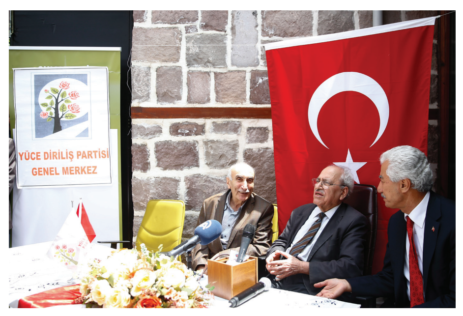
Sezai Karakoç, President of the Exalted Revival Party ( Yüce Diriliş Partisi ), speaks during the party's 3<sup>rd</sup> congress in Ankara, on May 29, 2016.