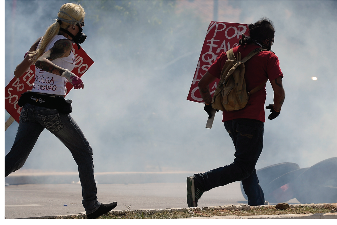
BRAZIL, Fortaleza: Anti-government demonstrators run away from tear gas.

and Turkey's major export markets have added to an environment where the moves of their respective central banks have been watched closely.