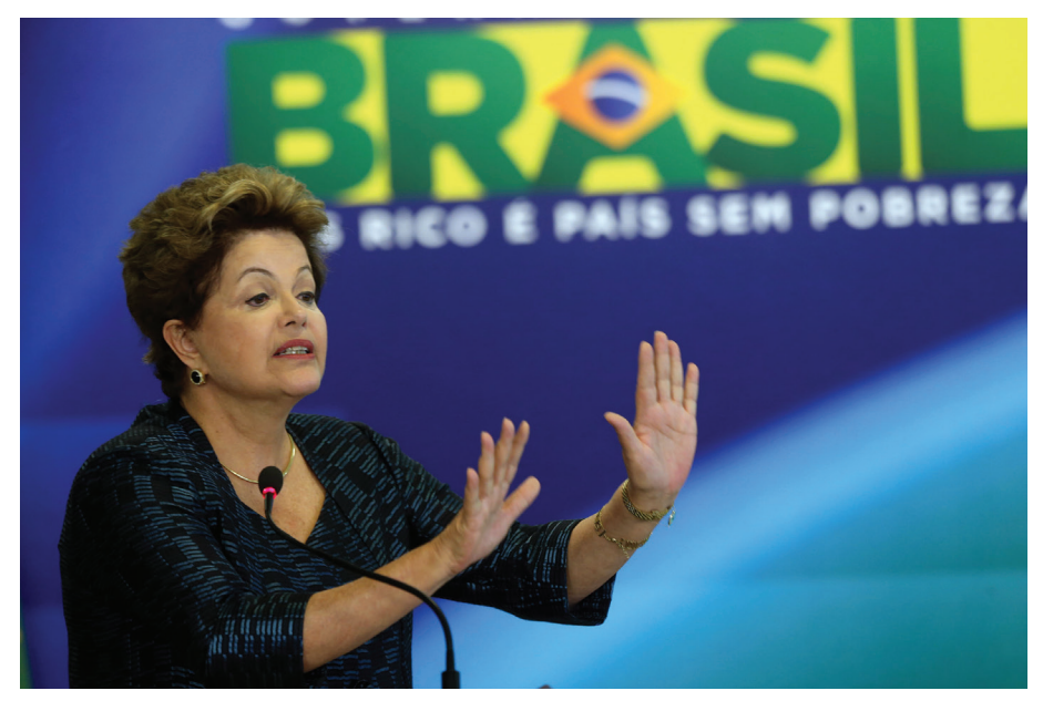
BRAZIL, Brasilia: The president of Brazil, Dilma Rousseff during the signing ceremony of the first public announcement of terminals for private use, at the Planalto Palace, seat of government in Brasilia, capital of Brazil.