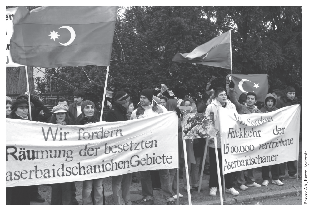
If the Turkish-Armenian border is opened, the Azerbaijani people will find themselves in a hopeless, desperate situation, and will lose faith in Turkey.

transportation, or the emergence of economic and educational projects aimed at restricting Turkish influence in Azerbaijan.