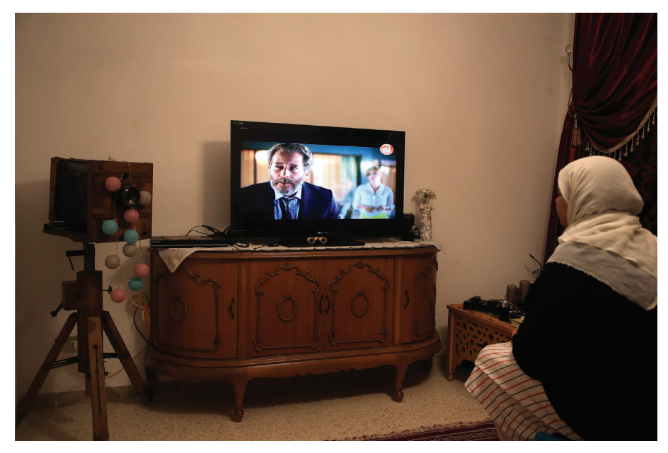
Turkish series continue to dominate television screens, appealing to the tastes of Tunisians for the last 10 years. Television channels in Tunisia compete with each other to broadcast Turkish TV.

The branding "Turkish" of a soap opera will influence and impact on the decision of the viewers, as consumers tend to pay attention to the origin to assess the quality of the production. This aspect poses the question of the subjective views and beliefs a person has about a country. These views can be false or biased, but the consequences of these views will be real as they will impact the choices of the person, which leads to a form of consequentialism, as presented by the work of Berger and Luckmann.<sup>36</sup>