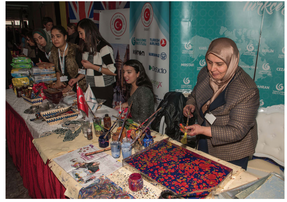
Turkish culture is received with interest in Morocco. A cultural activity by the Yunus Emre Institute, Rabat, December 4, 2017.

ern religious and cultural heritage. As underlined by Jana Jabbour,<sup>56</sup> Turkey is perceived as a regional power whose potency is not threatening and which is not aiming at interfering in the internal affairs or at imposing its domination on a given country. Thus, it seems clear that Turkey benefits from what can be called a middle-sized power privilege since its power does not seem as menacing as the western superpowers.