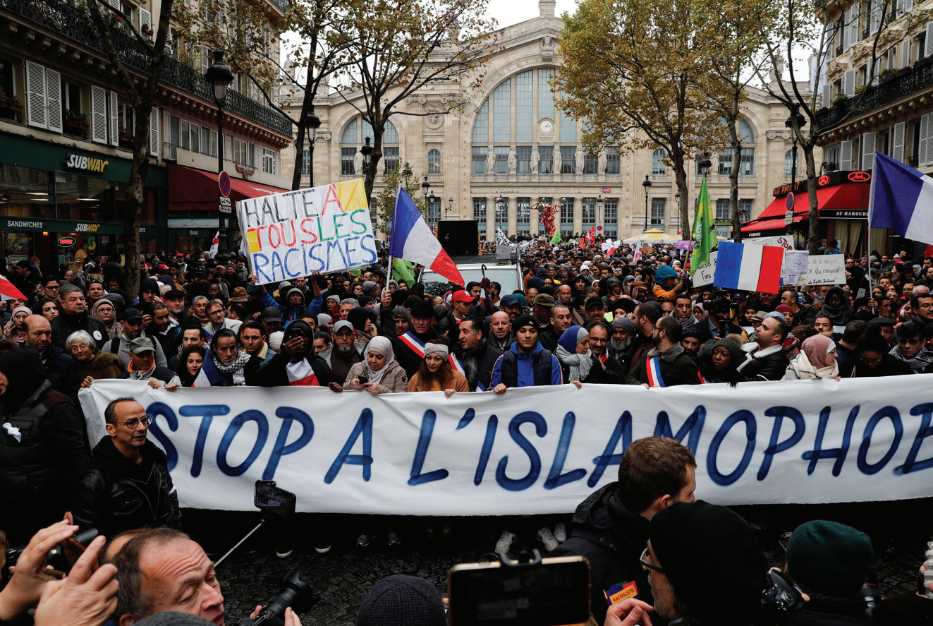
Demonstration march in front of the Gare du Nord, in Paris to protest against Islamophobia, on November 10, 2019.