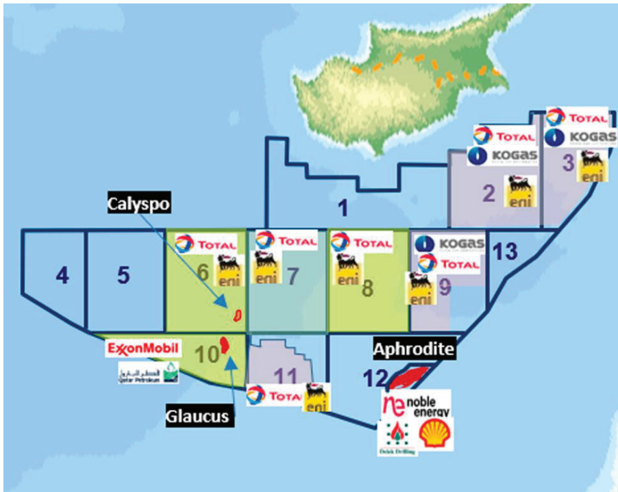
Map 1: Offshore Exploration Licences Granted by the GASC

Mediterranean policy. Within this framework, it is not surprising that during the European summit of December 11, 2020, France and Greece insisted on heavy economic measures for Turkey; however, only minor sanctions were imposed in order to maintain stability in the region. 50