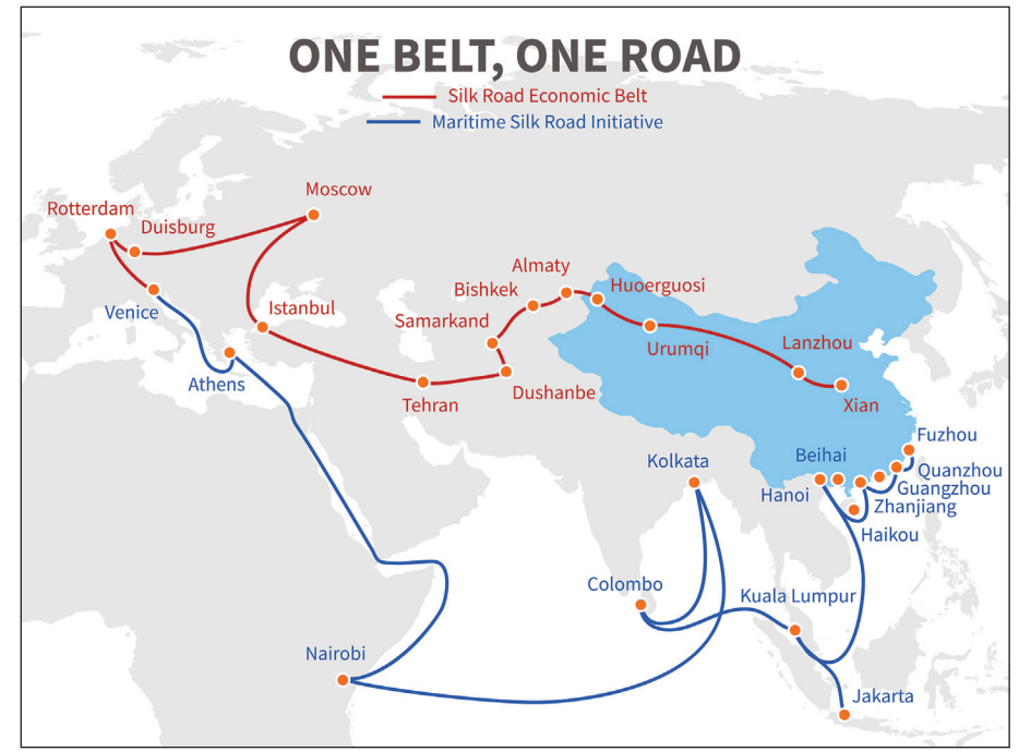
Belt and Road Initiative, the Chinese modern Silk Road project. Vector by MicroOne / Depositphotos

MCI countries, need to devise a mutually agreed-upon mechanism to tackle security threats.