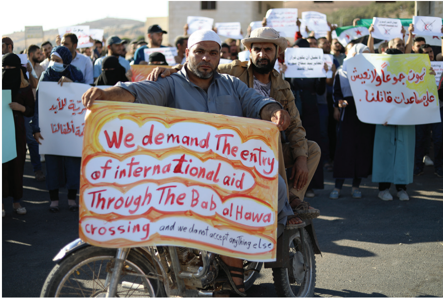
Displaced civilians and NGO representatives came together to protest the blocking of UN humanitarian aid because of Russia's veto, at the Bab al-Hawa Border Gate in Idlib, Syria, on August 2, 2023.

ering alternative interpretations, highlighting the role of personal attitude in decision-making (Interview with Expert 5).