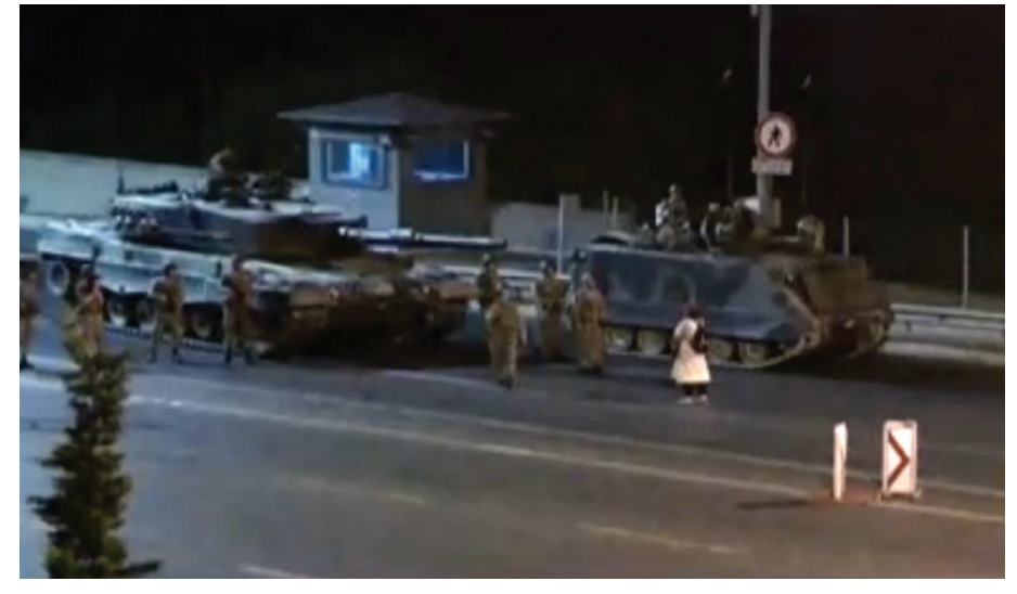
Safiye Bayat, a 34-year old mother of two, having walked for 45 minutes to reach the Bosporus Bridge, stands alone in front of the tanks to confront the coup plotters

self: "Today is the day to go outside and defend the country; if we do not go outside today, it will be too late tomorrow." Topaloğlu marched to Sarachane along with other citizens and stood against the coup plotters. She was wounded by one of the coup plotters who opened fire on her. This strong fighting spirit and determination of resistance drew the women of Turkey to the streets to stop the coup attempt, regardless of their age and ability. Fikriye Temel, a 75-year old woman, stood against the tanks with her stick on her hand and fought to protect democracy. This mother of four children who lives in Ankara rushed into the street during the coup attempt and hurried to the Presidential Complex to do what she could; the photo of this elderly woman with her stick went viral on social media and became a symbol of the courage and determination of Turkish women in defending their country and democracy against the coup. Temel