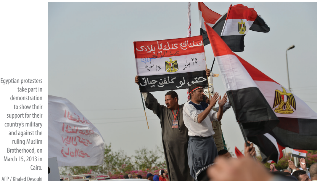
Egyptian protesters take part in demonstration to show their support for their country's military and against the ruling Muslim Brotherhood, on March 15, 2013 in Cairo.

Again there is a question of legacy as Egypt has moved from food independence to food import dependency.