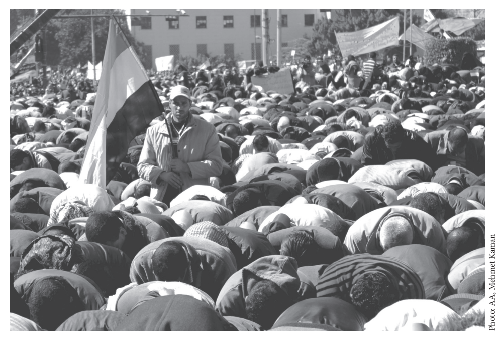
The forces of religion have indirectly and inadvertently benefited from the authoritarian policies of the post-colonial Arab state in part because all rival secular political organizations have been suffocated or crushed.

tend that the history of religion-state relations and the role of religion in public life have been qualitatively different in Muslim societies than in the West. Different political lessons have been learned on both sides of the Islam-West divide as a result. Part of the problem here is one of perception.