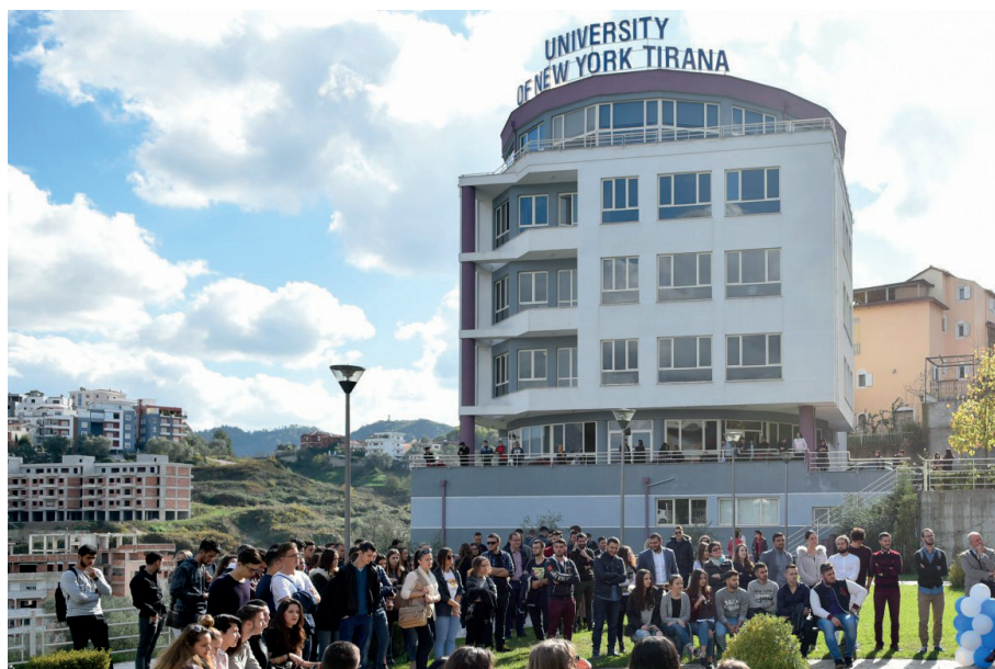
University of New York Tirana is a university managed by the Turkish Maarif Foundation in Albania.

University of New York Tirana / Turkish Maarif Foundation