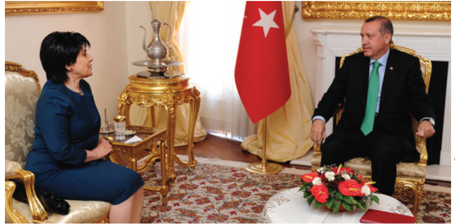
Prime Minister Recep Tayyip Erdogan met with Leyla Zana on June 30, 2012 in Ankara to discuss the Kurdish issue.

towards positive mutual engagement and the idea of creating a shared plan for peace. This section examines a number of possible steps to be taken to achieve this goal.