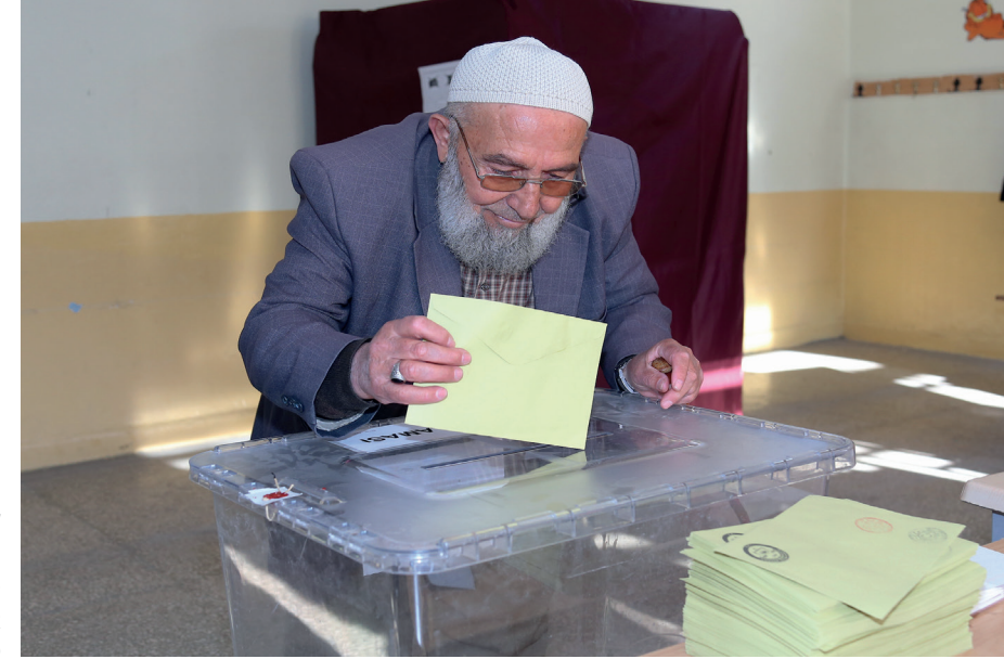
86 percent of the Turkish electorate voted in the presidential and parliamentary elections on June 24, 2018.

Analyzing the changes in the names and functions of the ministries, the former Ministry of the European Union has been merged with the Ministry of Foreign Affairs, the Ministry of Family and Social Policies has been merged with the Ministry of Labor and Social Security, and the Ministry of Forestry and Water Works was merged with the Ministry of Food, Agriculture and Livestock. Meanwhile, the Ministry of Transportation, Maritime and Communication, and the Ministry of Science, Industry and Technology have been renamed.