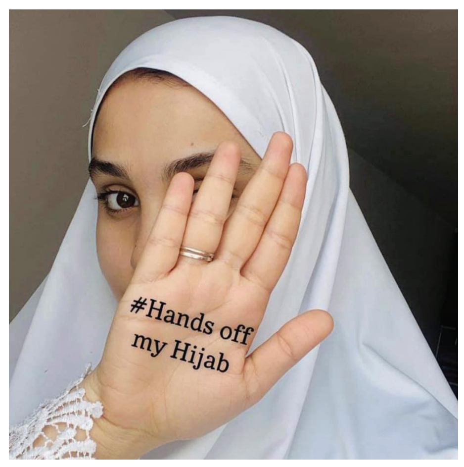
Muslim women in France protest the plans for banning the headscarf, which is on the agenda of politicians, with the 'Don't touch my headscarf' movement on social media.