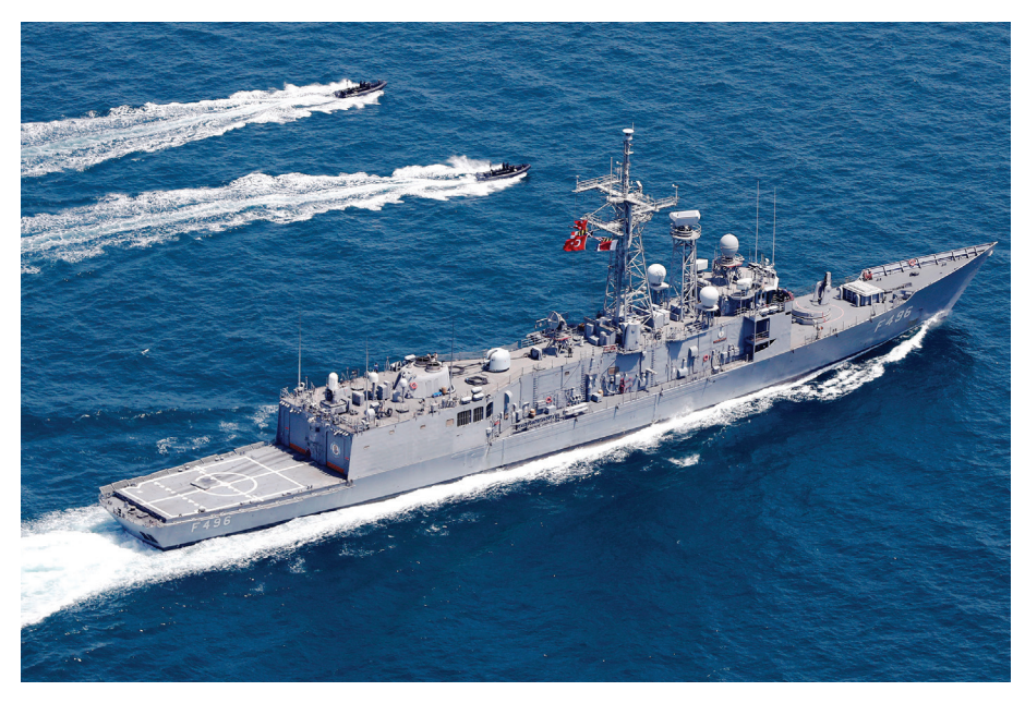
Soon after the blockade against Qatar, Turkish and Qatari naval forces conducted a joint military exercise.

East and undermining the Trump Administration's attempt to rally the Sunni Arab world against Iran. The White House readout of a telephone conversation between President Trump and Emir Tamim on January 15, 2018 during which the president praised Qatar's support in countering terrorism was a 180-degree flip from the presidential tweets on the second day of the crisis in June 2017. The conversation signaled to the 'Quartet' capitals that any lingering hopes they had of co-opting President Trump's support for their move on Qatar were dead. It remains to be seen whether and how the Trump Administration may pressure the 'Quartet' to come to the negotiating table, perhaps by scheduling a meeting of Gulf leaders at Camp David. The example of the GCC summit in Kuwait in December 2017, which ended in disarray and acrimony on the first morning of