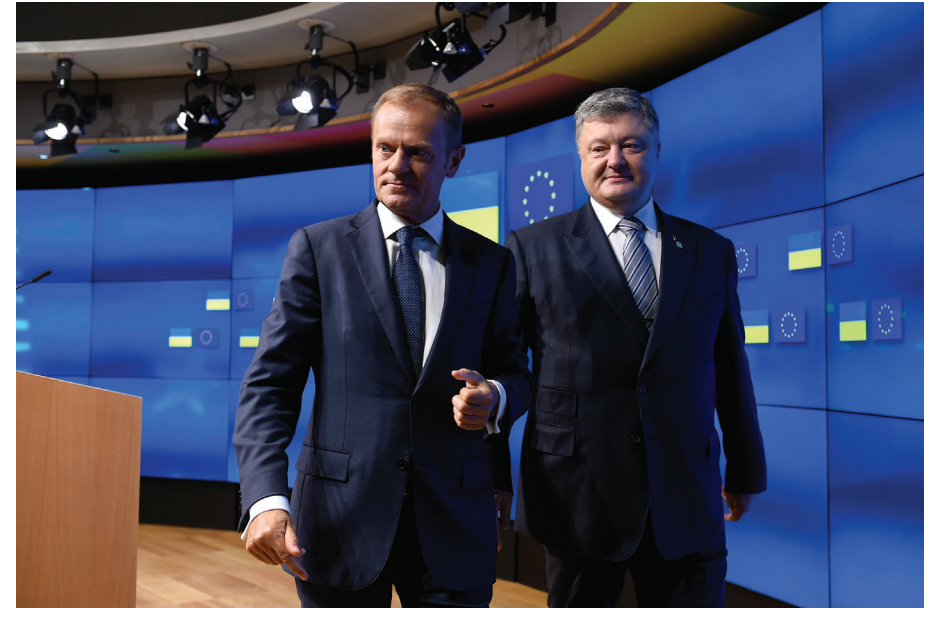
President of European Council Tusk and Ukrainian President Poroshenko leave after a press conference during an EU leaders summit at the European Council, in Brussels, on June 22, 2017.

cant role in international relations. But only when it incorporated the bulk of Ukraine's territory by the end of the 18<sup>th</sup> century did Russia truly become both a European empire and a European great power. At the same time, the incorporation of millions of Eastern Slavs residing in the lands of ancient 'Rus' that were earlier ruled by Rurikid princes marked a crucial moment: from that point on the Ukrainian question became inextricably linked to the Russian question, at the heart of which has been an ongoing (and still open-ended) process of forging the Russian nation.<sup>16</sup>