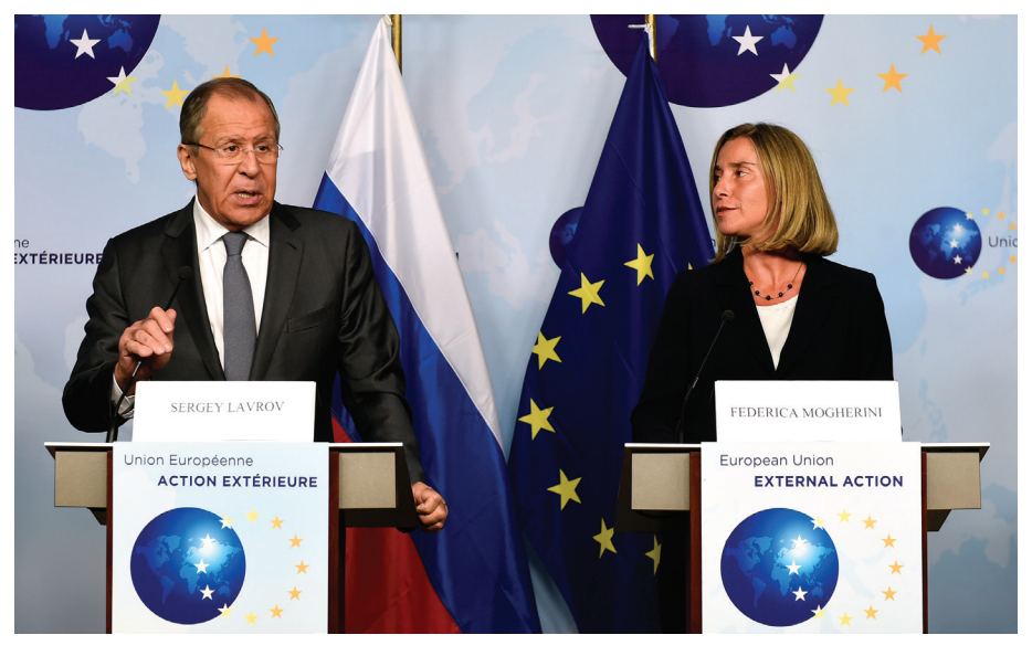
High Representative of the EU for Foreign Affairs and Security Policy, Federica Mogherini and Russian Foreign Affairs Minister Lavrov give a joint press conference after their bilateral meeting at the EU headquarters in Brussels on July 11, 2017.