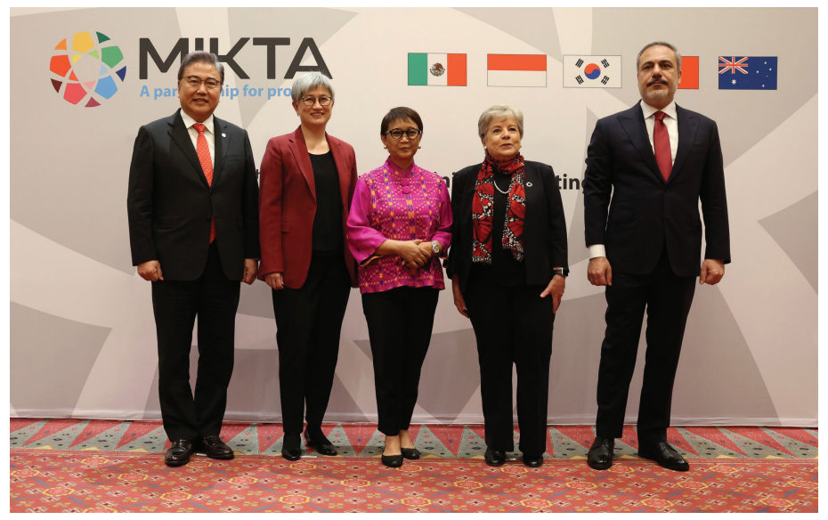
Turkish Foreign Minister Hakan Fidan (R) attends the 24<sup>th</sup> MIKTA Foreign Ministers' Meeting in New York, U.S. on September 23, 2023.