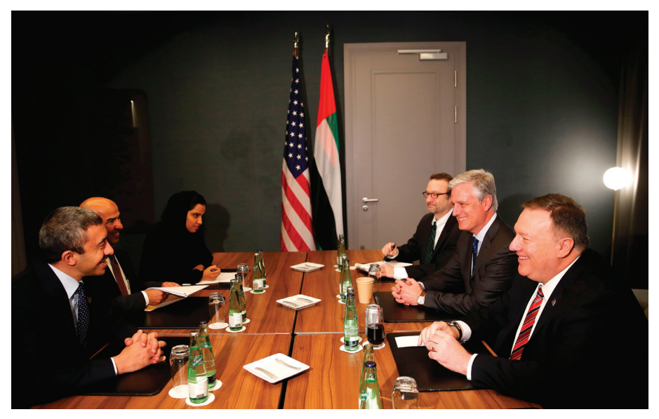
U.S. Secretary of State Mike Pompeo (R) meets UAE Foreign Minister Sheikh Abdullah bin Zayed al Nahyan (L) for bilateral talks prior to the Peace summit on Libya in Berlin, January 19, 2020.

inal gangs, and even radical Madkhali Salafi groups. <sup>14</sup> The fact that the LNA depends on radical Salafi refutes the claim that Haftar and his backers –mainly the UAE, Egypt, and France– are countering terrorism or radicalism in Libya, and instead reinforces the claim that this card has been used as a pretext to expand the LNA's control over Libya, gain legitimacy and rally support from the international community.