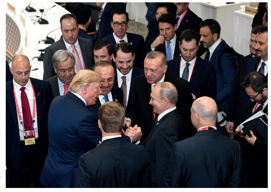
Leaders of Turkey, Russia, and the U.S. chat during the "Climate Change, Environment, and Energy" Session of G20 Summit on June 29, 2019, in Osaka, Japan.

ing to Mounk, the masses are right to accuse the elites of moving away from working in the interest of the common people -as the wave carrying Trump demonstrates.<sup>5</sup> Yet the exclusion of minorities, anti-immigrant sentiments, and xenophobia threaten the idea of peaceful coexistence within Western societies.