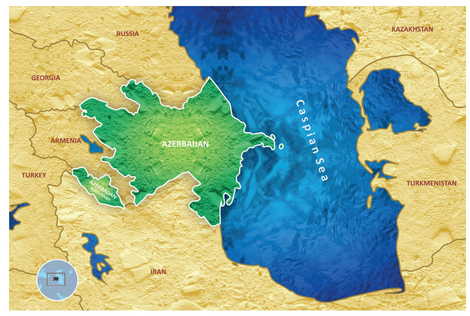
Republic of Azerbaijan and its neighboring countries.

plying the condominium principle to the division of the Sea, then other littoral states would have had a share in the hydrocarbon resources in its northern Caspian sector.<sup>45</sup> With the election of Vladimir Putin as president of Russia in 2000, Russia began to follow a more active role in Caspian Sea issues. The intention of the new Russian provision on the legal status of the Caspian was to solve problems gradually; first, focus on the ecological and navigation problems, then solve the dispute between the southern coastal states regarding the offshore fields situated on the median line and as a final stage come to a conclusion on the Caspian Sea's legal status.46